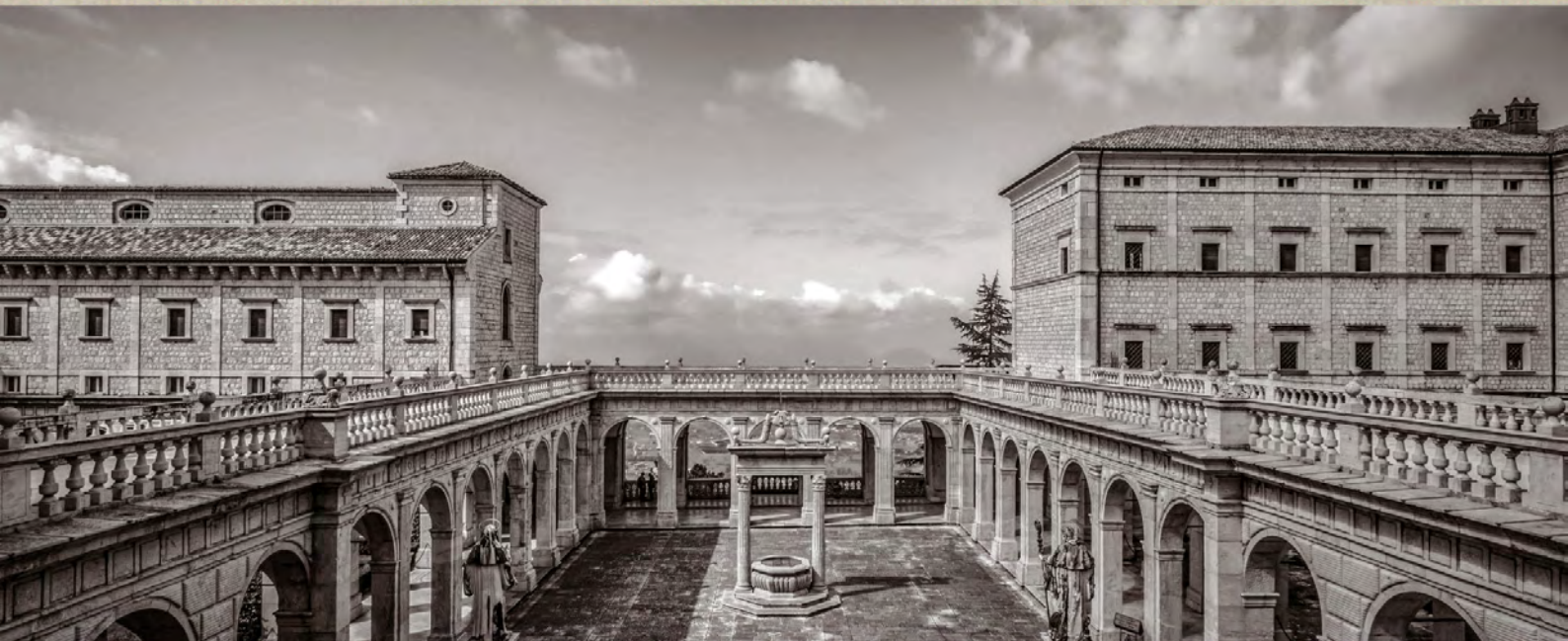
ABBZIA DI MONTECASSINO